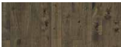
Harper Maple NO6HARM