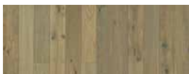
Steinbeck Oak NO6STEO