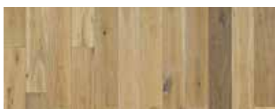
Hemingway Oak NO6HEMO