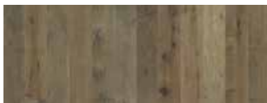
Frost Maple NO6FROM