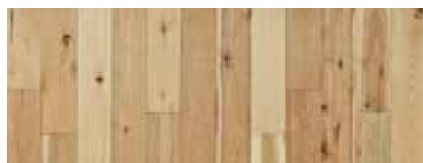
Melville Hickory NO6MELH