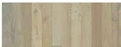
Hawthorne Oak NO6HAWO